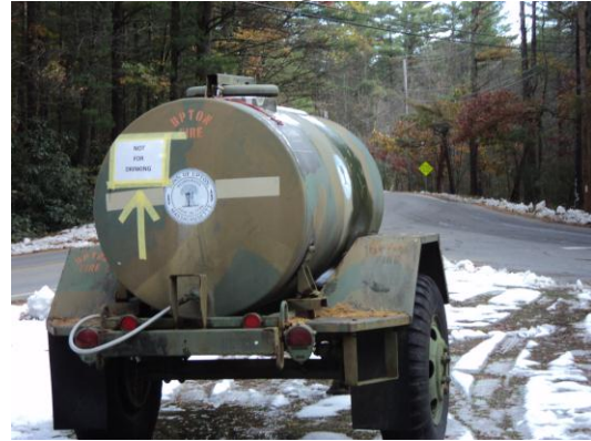
Water Buffalo

Many people in Upton were without power for several days following the late October snowstorm. Trees still had their leaves and the weight of the heavy wet snow brought down many limbs and wires. Upton Fire Department provided "water buffalos" for residents in need of water. This one was located near Upton State Forest at the intersection of North Street and Westborough Road.