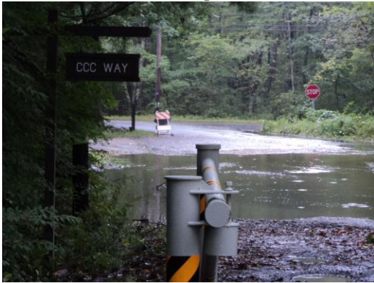
CCC Way after Tropical Storm Irene