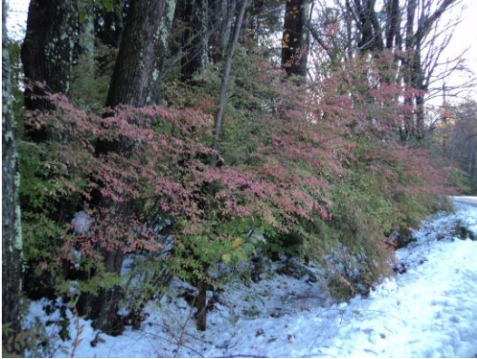
Winged Euonymus along CCC Way

In our last newsletter, we discussed Oriental bittersweet, an invasive vine. If you visit the Headquarters area of USF right now there are several areas where the berries are plainly visible. Another invasive plant obvious there now is Euonymus alatus (Thunb.) Sieb., which is also known as Winged Euonymus or Burning bush.